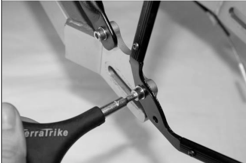
Step 1: Attach rear fender stay to frame (Rover shown).

Remove rear wheel and install both rear assemblies. Some rear fender setups will only require one M5 bolt per dropout. If you're not familiar with removing and reinstalling your rear wheel, please take your trike to a certified bike shop for fender installation.