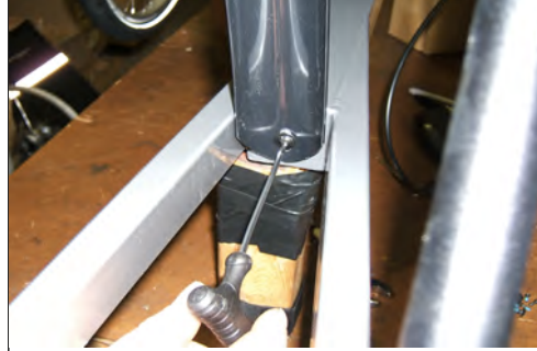
Step 2: Attach Fender to back of frame.

Remove rear wheel and install both rear assemblies. Some rear fender setups will only require one M5 bolt per dropout. If you're not familiar with removing and reinstalling your rear wheel, please take your trike to a certified bike shop for fender installation.