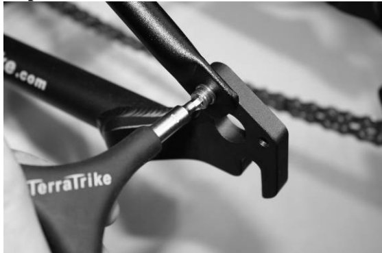
Detach the rear seat stays and reattach them to the inside of the drop outs (Step 2) w/ M5x12 bolt.