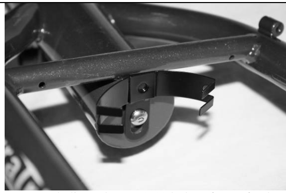
Use metal clip and an M5x12 bolt to fasten fender to frame or fasten fender directly to frame.