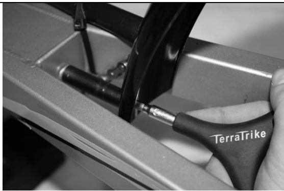
Install stand-off tube with M5x65 bolt.