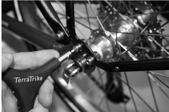
Use both mounting locations to bolt fender stays to frame w/ M5x12 bolts.