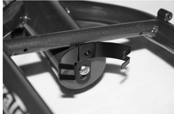
Use metal clip and an M5x12 bolt to fasten fender to frame or fasten fender directly to frame.