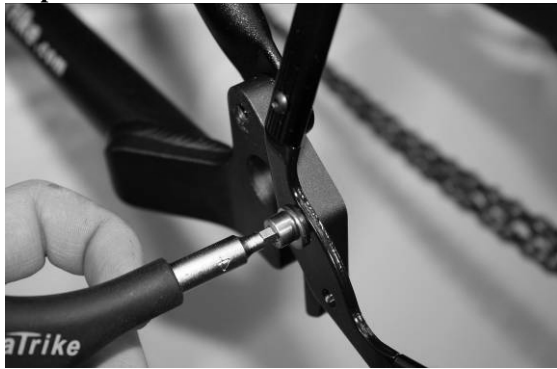
Install rear fender in forward mounting bracket hole with M5x12.