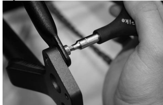
This gives sufficient clearance for the fender stays.