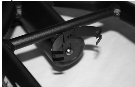
Use metal clip and an M5x12 bolt to fasten fender to frame or fasten fender directly to frame.